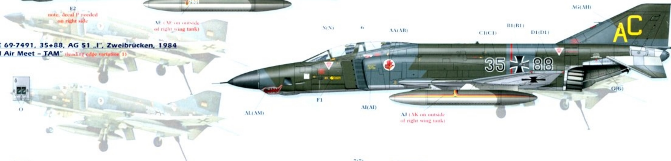
6. RF-4E 69-7491, 35+88, AG 51 „I“, Zweibrücken, 1984 „Tactical Air Meet – TAM“ (leading edge variation 1)