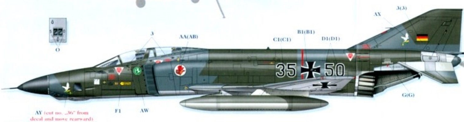
3. RF-4E 69-7497, 35+50, AG 51 „I“, Bremgarten, June, 1978 „Squadron exchange with 36° Stomo from Gioia del Colle, Italy“ (leading edge variation 1)