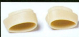
MMK4803 J-35B Intakes