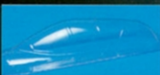
MMK4802 J-35B Canopy