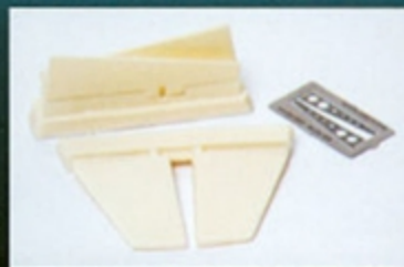
MMK4808 J-35 Flaps Set