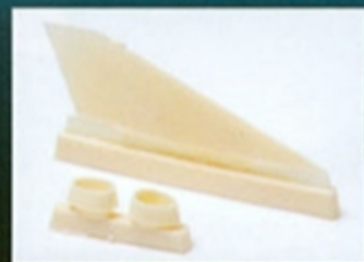
MMK48?? J-35B Backdate Set