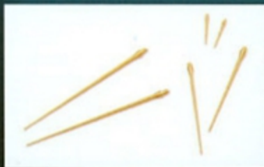
MMK4805 J-35 Brass Pitot Tubes