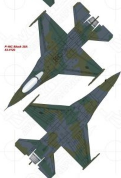
F-10C Block 25A 63-0720

FS26921 Feston AM 1708 Gunze Sangyo 031 Akracolor 0323 Xtracrylix XA1129